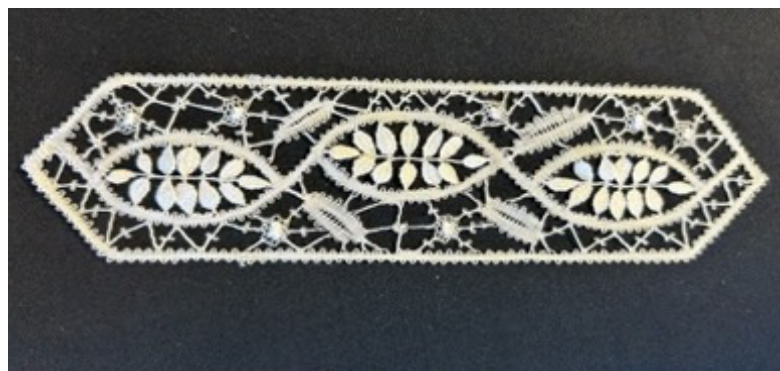
Marion's exquisite Beds bookmark