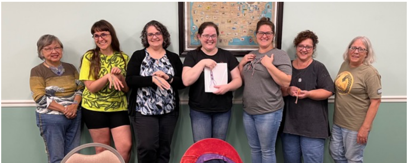
What a great group of budding lacemakers!