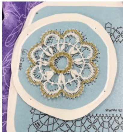
Amy's Beds Motif