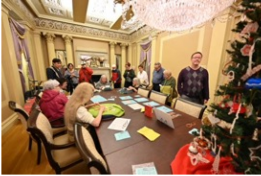
A view of the Croghan-Schenley Room lace display

This demonstration is always one of our favorites, and a meaningful kickoff to the holiday season!