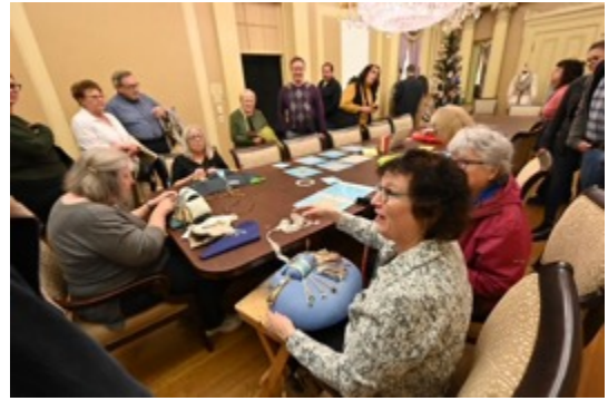
Members interacting with Nationality Room visitors