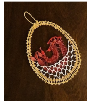
Sandy's Basket o' Chicken