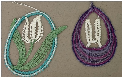
Easter eggs worked by Amy