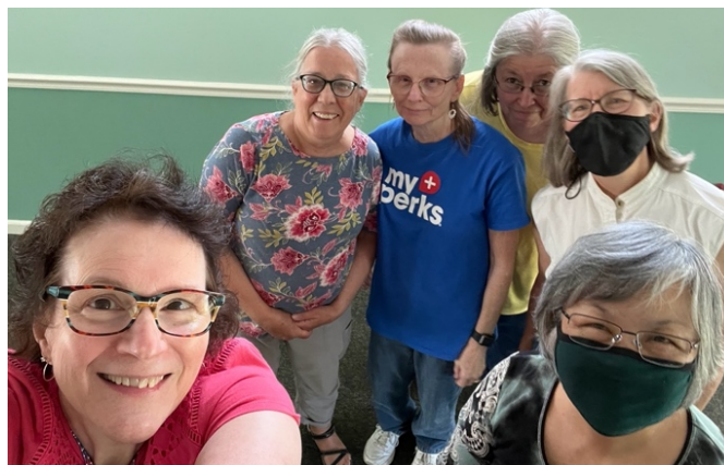
The happy campers! We are all smiling—I promise!