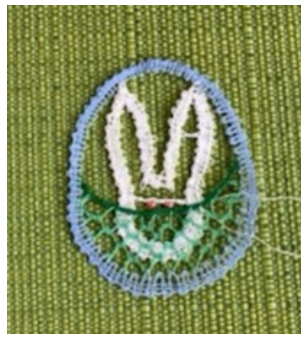
Sandy's sweet bunny