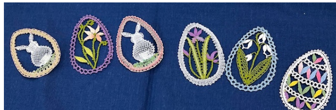
Easter eggs worked by Dewi