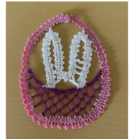
My bunny egg basket