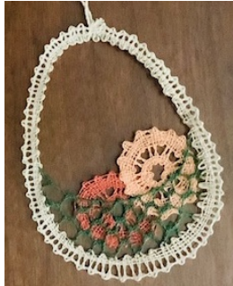
Sandy's Easter Eggs in an Egg