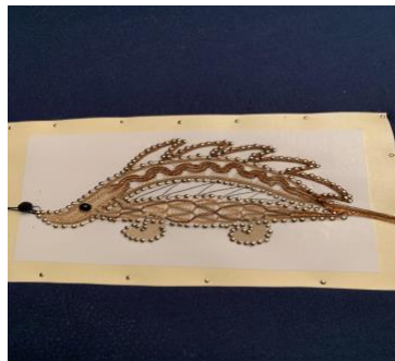
Becky: Hedgehog. She also finished the seahorse and moon.