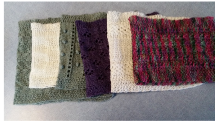
Amy's cowls were a warm and thoughtful gift!

This is a thorough description of different stitch patterns that were combined to create an afghan. Each block is unique. Since many of the ladies that I knit with were working from this book, I decided that I could make cowls from my balls of left over sock weight yarn. I am not sure if I ran out of yarn or time before the Christmas Party, but lots of lace makers got new cowls. The instructions in the book are thorough and easily understood. If you want to try a different pattern for a scarf or cowl, this might have the answer you want.