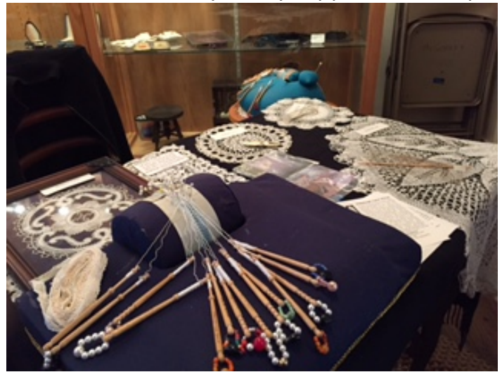
Lace Display at the McGinley House

The people from the Historical Society always appreciate our participation.