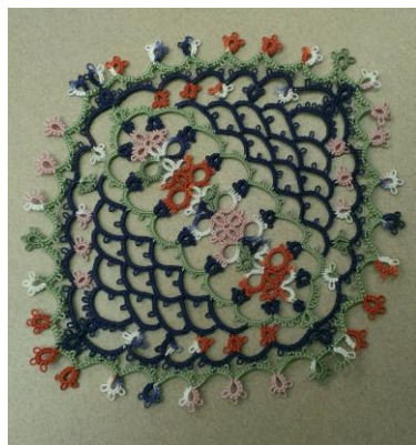
Round Robin Tatting Project 1

Nancy brought samples of the project to share with us, and we were very amazed at the intricacy of the samples. (In addition, she offered several times to teach us how to shuttle tat, and one member was interested, but, sadly, the tools were unavailable.) Pictures of three projects Nancy shared with us are below.