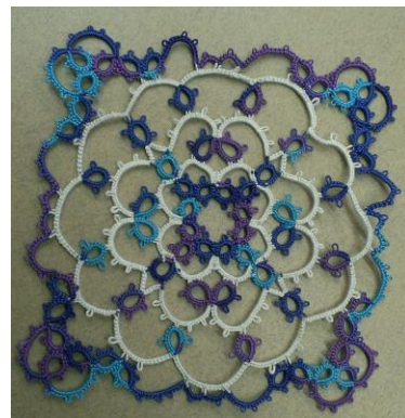
Round Robin Tatting 2