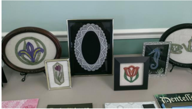
Some of Louise's beautiful samples