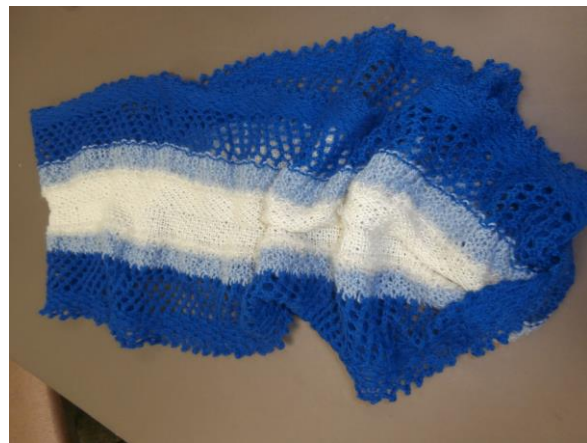
The scarf, seen on Supermodel Kathy Timmons