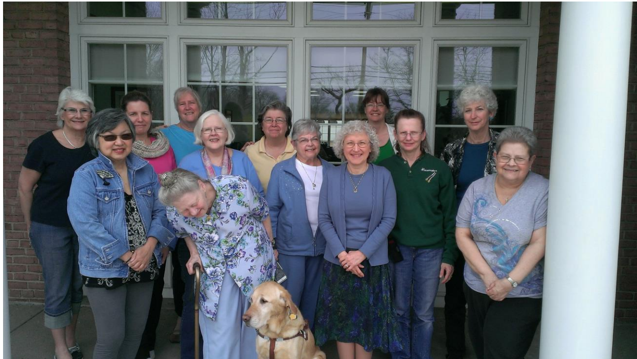
Our group portrait at the end of a great workshop!