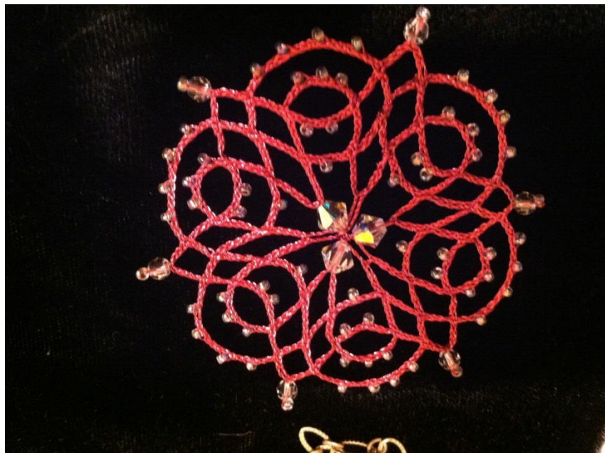
A wire medallion