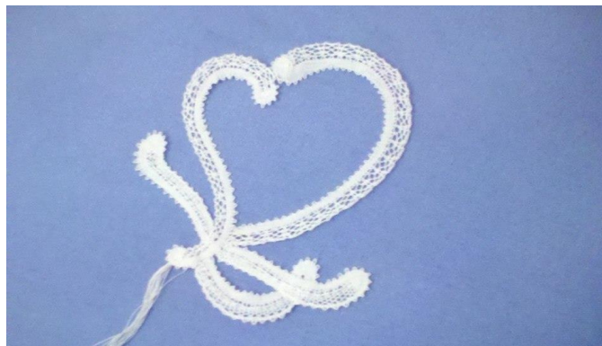
A rare completed project by the editor

The Pittsburgh Lace Group would also like to welcome the newest addition to the lacemaking world, the Lacers of the Lake from Cortland, Ohio. LOL sounds like a really fun group of lacemakers. They have been deemed an official charter chapter of IOLI and were announced at this year’s IOLI convention. One of their recent meetings was just last week in the Cortland, OH, library, where they met library patrons and showed off their skills. They plan to move their monthly meetings to the library in Howland, OH, beginning this September.